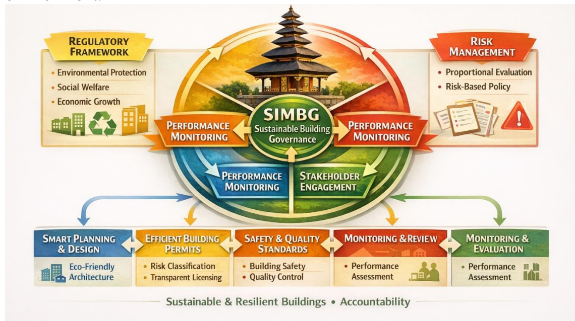
Figure 2. Integrative Risk and Performance-Based SIMBG Model for Sustainable Building Governance in Gianyar

A further critical dimension of this study is the integration of local cultural values into the building governance framework. The inclusion of Tri Hita Karana and Asta Kosala Kosali introduces a culturally grounded perspective that complements technical and regulatory considerations. These principles emphasize harmony between humans, nature, and the spiritual realm, as well as spatial order and proportionality in architectural design. The findings indicate that incorporating these values into the SIMBG evaluation process enhances regulatory compliance, strengthens stakeholder acceptance, and ensures that development aligns with local identity. This is particularly significant in Bali, where cultural values are deeply embedded in spatial planning and architectural expression. The integration of cultural principles thus contributes not only to regulatory effectiveness but also to the sustainability and authenticity of the built environment.